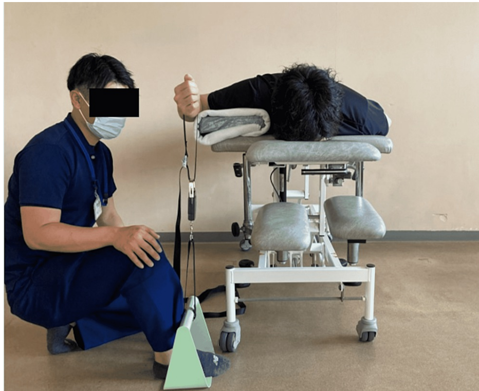
FIGURE 2: Strength measurement of shoulder external rotators using a suspension scale.

participants were laid in a prone position on the bed in the following positions: 90° shoulder abduction, 90° external rotation, 0° horizontal adduction/abduction, 90° elbow flexion, and 0° forearm pronation/supination (Figure 2). Additionally, to maintain the measurement position of 0° shoulder adduction/abduction, the proximal humerus was placed on a 5 cm platform.